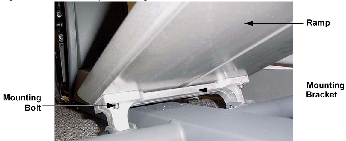
Diagram 7.9 - Rear Ramp Mounting